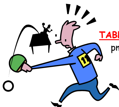
TABLE TENNIS - Every Thursday at the Youth Club, next to The Hub 2.30 - 4.00 pm. Experienced players or total novices very welcome. Bats and balls provided.

LINE DANCING - delighted to report that we are continuing with our Line Dancing "classes" on 3rd Monday of each month 10.30 - 11.30, at Halton Village Hall. We have several new members so anyone else who would like to start from scratch, please come along to our meetings and have some fun, mental and gentle physical exercise.