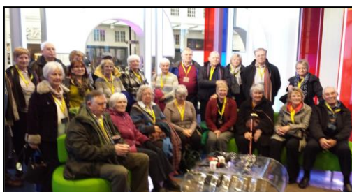
The Group in the Today Studio